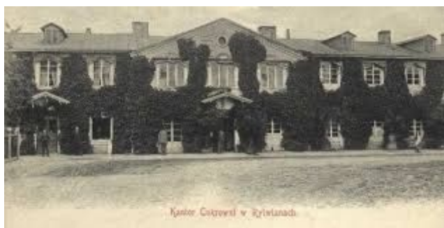
Office building of the Sugar Factory in Rytwiany. (it was remodelled into a palace by next possessors in next years)